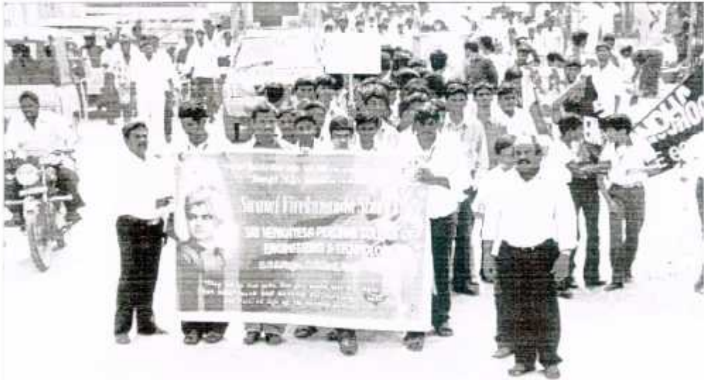
Students participated in the rally during National Youth Day Celebrations