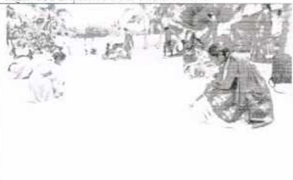
Students participated in Rangoli event organized as part of NSS Youth Festival