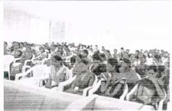
Girl students and Women Faculty participated for Womens Day Celebrations.