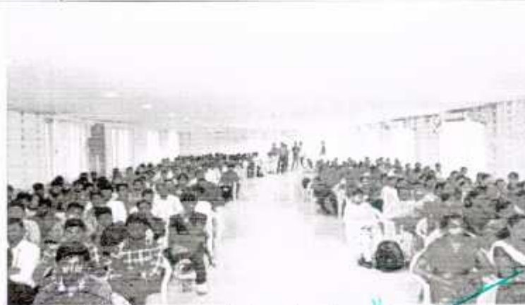
Staff and Students attended for Teachers Day celebrations