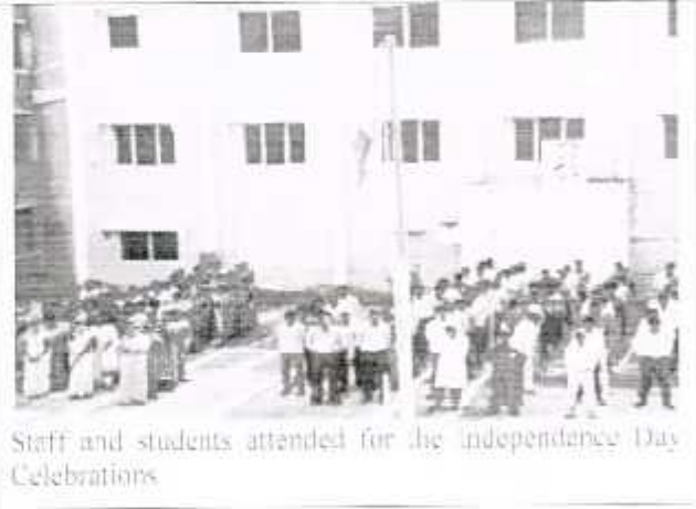
Staff and students attended for the Independence Day Celebrations