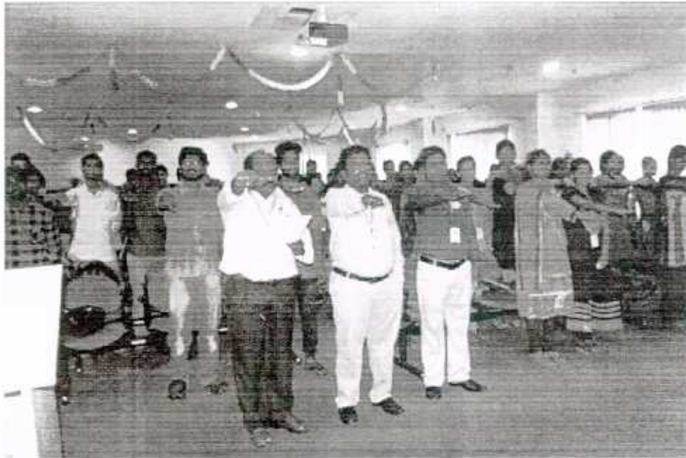
Pledge taking program during NSS Foundation Day Celebrations