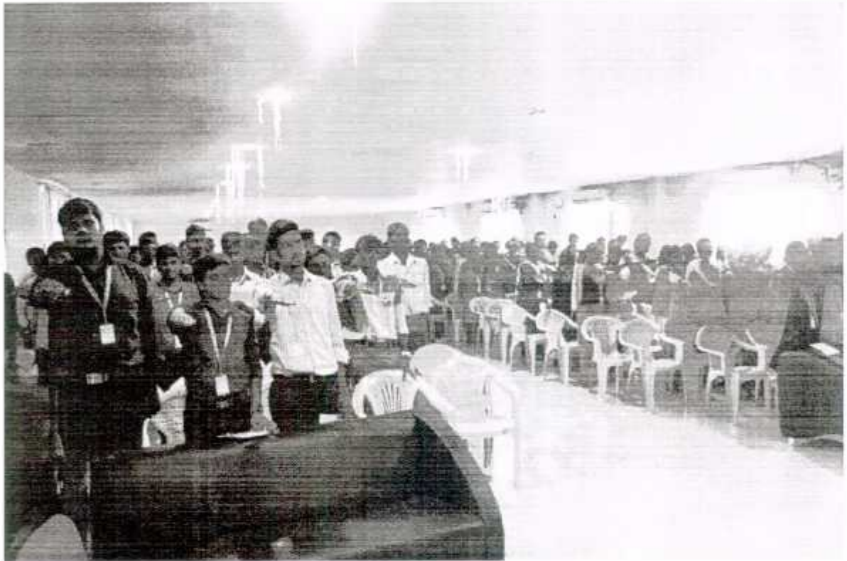
Pledge Taking programme during Rashtriya Ekta Divas