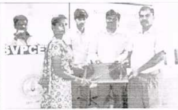
Distributing Appreciation Certificate and Memento to Best student awardees during Engineers Day Celebrations