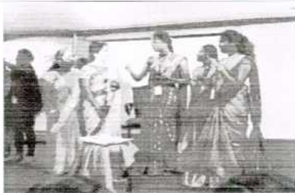
Women Staff celebrating the International Womens Day