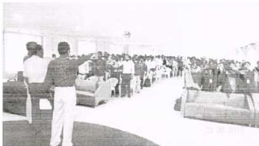
Pledge taking program on the eve of national sadhbhavana Diwas