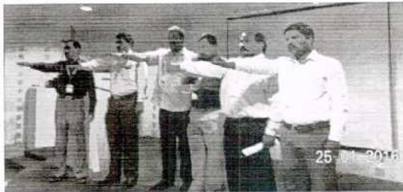
Staff attended for Awareness program on Right to Vote

The students are informed to compulsorily enroll their names, get the voter identity card and participating in various elections of central, state, and local self governments for voting.