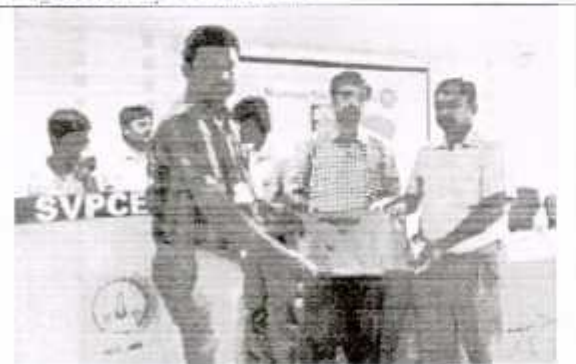
Distributing Appreciation Certificate and Memento to Best Teacher awardees during Engineers Day Celebrations