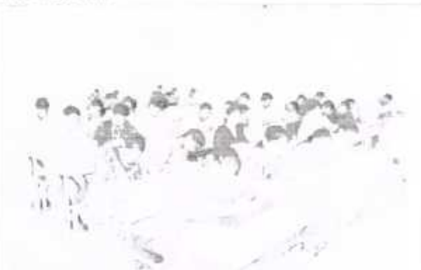
Students participated in Essay Writing Contest organized as part of NSS Youth Festival