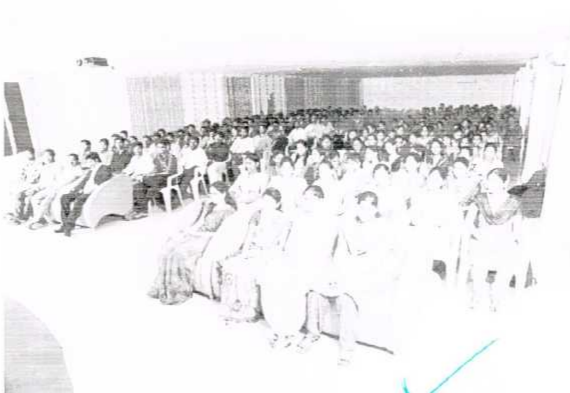
Staff and student attended for National education day celebrations