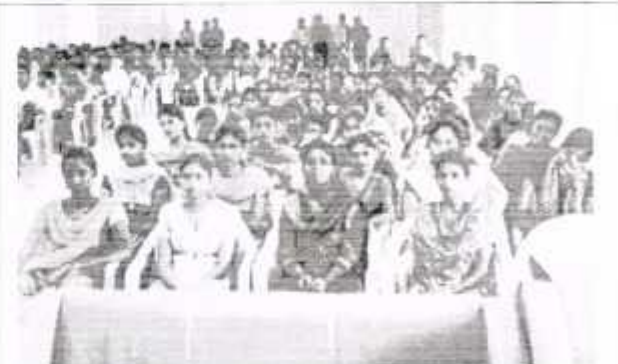
Staff and Students attended for Engineers Day Celebrations