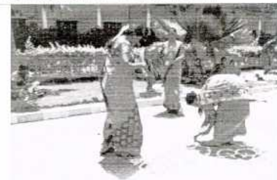
Students participated in Rangoli event organized as part of NSS Youth Festival