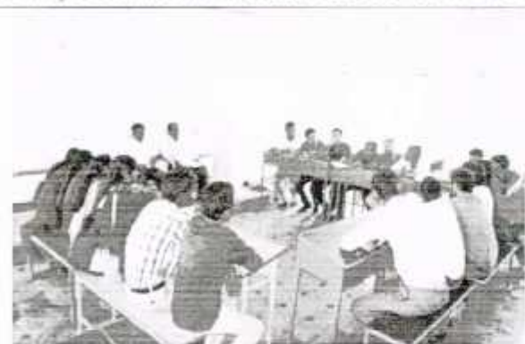
Students participated in Group Discussion event organized as part of NSS Youth Festival

As per the instructions of NSS Cell JNTUA, Anantapuramu, NSS Unit of SVPCET organized college level NSS Youth Festival-2016 and conducted several competitions like Singing, Essay writing, Patriotic poem writing, Classical Dance, Group Dance, Rangoli, Instrument playing and Debate among the NSS Volunteers and nominated the volunteers to compete in the District & State Level NSS Youth Festivals.