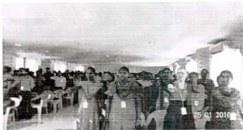
Pledge taking program during Awareness program on Right to Vote