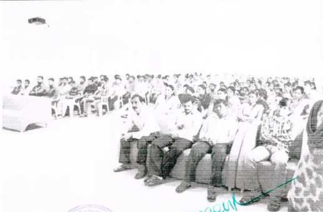
Staff and students attended for Legal Awareness Camp