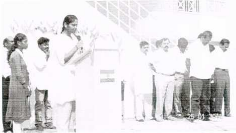
Address by the NSS Volunteer during Republic Day Celebrations