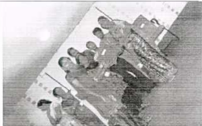
Students presenting Mementos to Teachers during Teachers Day celebrations