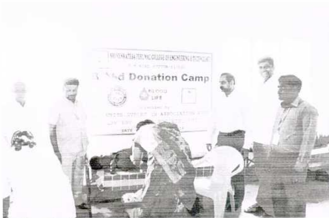
Blood Donors donating blood in the Blood donation Camp