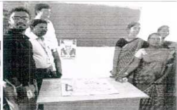
Staff & Students celebrating Teachers Day